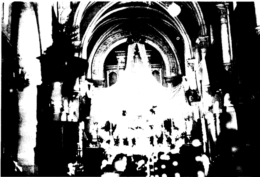
The gorgeous altar of a Palestinian Catholic Church. The Church is dedicated to Mary, who is mistakenly called "Queen of Heaven."