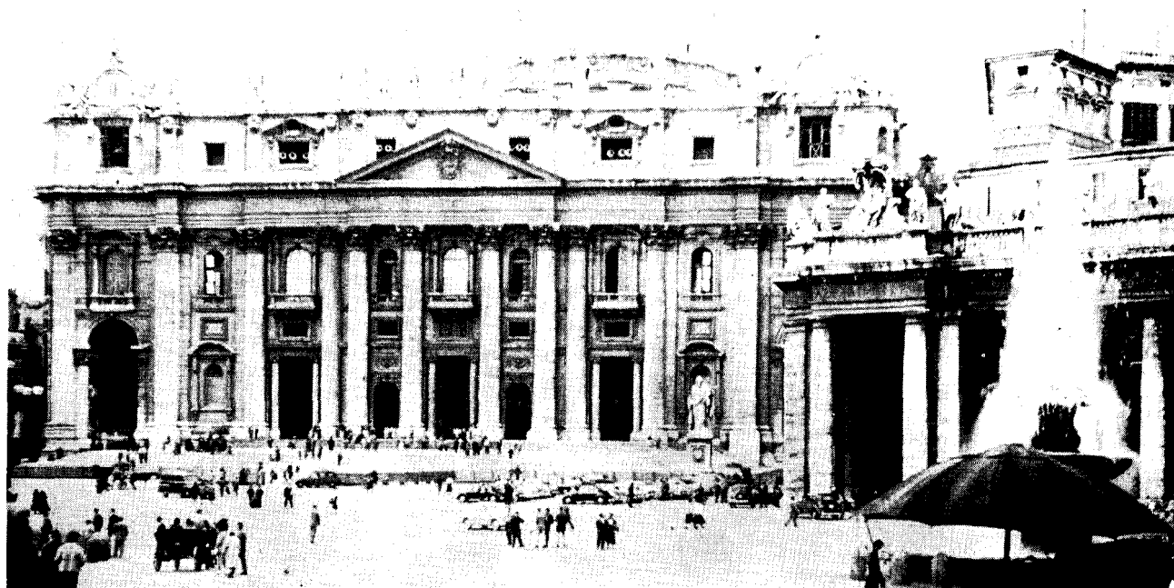
The world-famous St. Peter's Cathedral in the Vatican. Part of the Pope's Palace may be seen in the upper right corner. Note the immense statues atop the walls—compared with the visitors below.

After seeing Naples, we drove to the ruined city of Pompeii. This was the most startling place we have seen. In the year 79 A.D., Pompeii was completely covered with ashes from Mt. Vesuvius. It was a city of twenty-thousand people. While thousands escaped from the city to the sea, hundreds perished in their homes and in the streets.