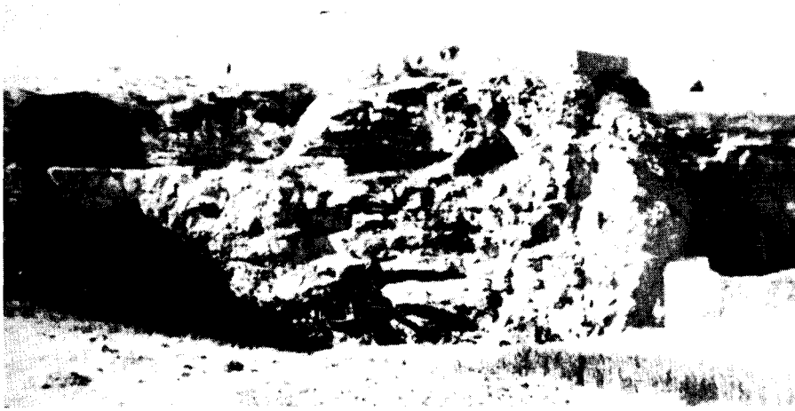
The rock above is called "Golgotha" in the Hebrew. It means "The Place of the Skull." Jesus was crucified atop this rock. Notice the natural caves forming the eyes and mouth.

From this place can be seen "The Place of the Skull." No one can fail to see the resemblance. There is a low eroded forehead, two deep hollows that make the eyes, a nose, and near the ground level, twisted lips.